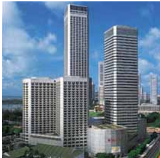
Raffles City, Singapore. Treated areas: slabs and walls, construction joints, water tank; 11,000 m 2 ; products used: VANDEX SUPER, VANDEX PREMIX.