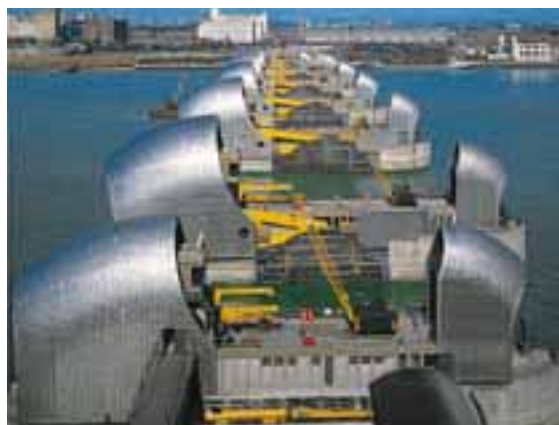
Thames Barrier, U.K. Treated areas: various applications for concrete waterproofing and protection; 2500 m 2 ; products used: VANDEX PREMIX, VANDEX SUPER.