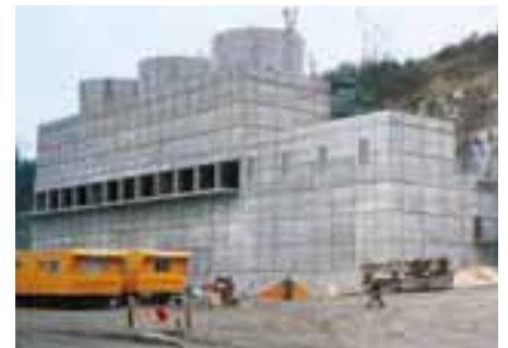
Peach Bottom Nuclear Power Station, Delta, PA, USA. Treated areas: cooling water tank, discharge tunnel: 4200 m 2 ; product used: VANDEX SUPER.