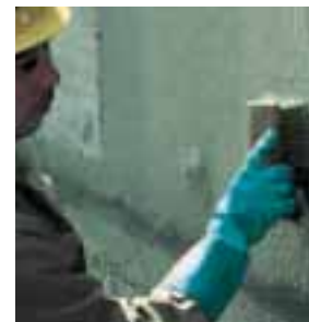
VANDEX SUPER application

Tokyo has rapidly developed into one of the world's major business centres. Now this prominent city has an appealing new venue – the magnificent Tokyo International Forum, a location where culture and information can be exchanged at an international level.